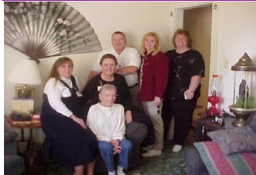
Staff with a patient after delivery of gifts.

We wanted to do something special for our patients and their families during the Christmas season. The volunteers generously brought in cookies and candy to make plates for the staff to deliver during the week of December 12th. Some of the staff went out and caroled as they delivered the goodies. The patients were very happy to receive such a wonderful present. We would like to thank the volunteers that helped with this project. You all did a great job.