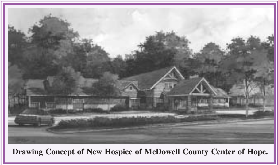
Drawing Concept of New Hospice of McDowell County Center of Hope.

The goal of the staff and the Board of Directors is to build a facility that will serve the needs of the community for years to come. It will include increased administrative and operational space, room to expand services for more patients, space to offer outreach programs for the entire community during times of