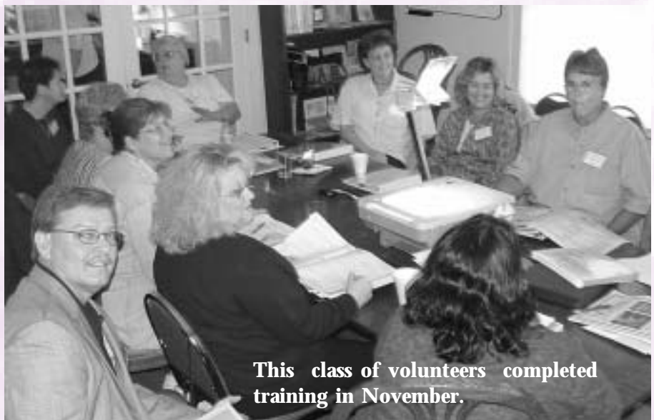
This class of volunteers completed training in November.

" I came to Hospice because I felt it was a good thing to do...a wonderful avenue to help other people...it's so rewarding to serve the families and they are always so appreciative of everything you do for them. I've been with some of my patients long enough to feel like part of the family and still keep in touch..."