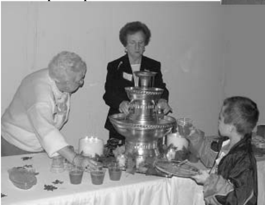
A reception was provided by our wonderful volunteers.